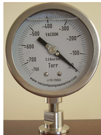
Bourdon Vacuum Gauge, 0 To -760 Torr, Liquid Filled